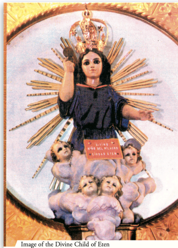
Image of the Divine Child of Eten

Send submissions to: granitebaymom@icloud.com