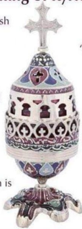
Matushka Speaks Up

The word mercy in English is the translation of the Greek word eleos. This word has the same ultimate root as the old Greek word for oil, or more precisely, olive oil; which was poured onto wounds and gently massaged in, thus soothing, comforting, and making the injured part whole again. The Hebrew word which is also translated as eleos and mercy is 'hesed,' which means steadfast love.