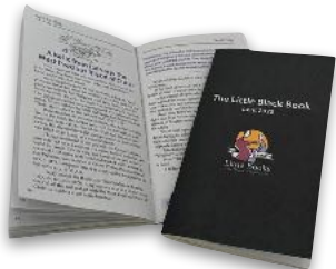
Excerpt from "The Little Black Book"

There is a key document from the Second Vatican Council that highlights the need for our full, conscious, active participation in the Mass. The encyclical, Sacrosanctum Concilium (Constitution on the Sacred Liturgy) , was approved by the Council and promoted by Pope Paul VI in 1963.