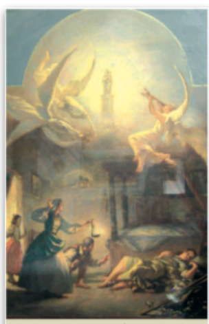
Ancient painting depicting the miracle in the Sanctuary of Pilar