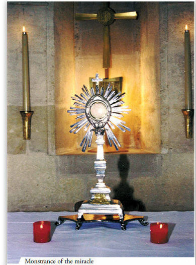
Monstrance of the miracle

Even today it is possible to visit the chapel of the miracle and venerate the precious relic of the Monstrance of the apparition, which is kept in Martillac, France, in the church of the contemplative community “La Solitude”.