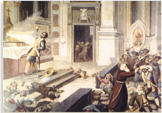
Ancient painting exhibited in the Church portraying the miracle

The lives of the Capuchin friars, however, were spared . A French soldier succeeded in opening the tabernacle which contained a ciborium with several consecrated Hosts. Flames of fire miraculously blazed out to envelop him - burning his face and his clothing. The door of the tabernacle which is adorned with agate and lapis lazuli or blue stones still shows the imprint of the soldier's scorched hand .