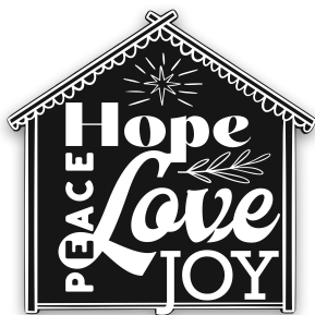
Themes of Advent

The first week of Advent marks the beginning of the new liturgical year . The tale of our salvation has circled back to its starting point : the expectation of the Messiah. This week intensifies our hope in the coming of a Savior Who will free us from the chains of sin and become our Way and our Light .