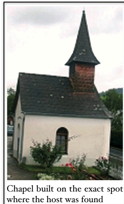
Chapel built on the exact spot where the host was found