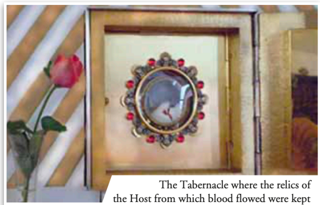
The Tabernacle where the relics of the Host from which blood flowed were kept

large pieces of the large Host which I had divided into 4 parts, I returned them to the paten. A little later I looked down towards the paten and I could not believe what I saw: one of the pieces of the Host that I divided was showing a red spot and from it a red substance began to emanate, similar to the manner in which blood escapes from a wound. After Mass, I took the Host and preserved it safely in the sacristy of the Shrine. The next day, at 6 in the morning, I went to see the Host and verified that some blood continued to flow and hadn't begun to dry. Still today, the blood appears as fresh."